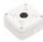
JB-EL121 Junction Box